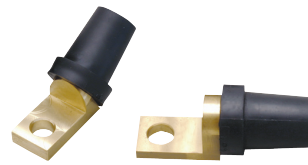
Female Angle Panel Mount • 400A / 600V

Item # CL40MR-ANGLE Item # CL40MR-OFFSET A B C D E F G H