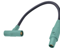
Soft Paralleling T • 400A / 600V • Male-Male-Female

Item # CL40FR-ANGLE Item # CL40FR-OFFSET A B C D E F G H