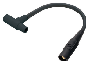
Soft Tapping T • 400A / 600V • Male-Female-Male