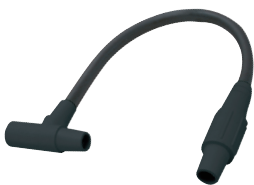
Soft Tapping T • 400A / 600V • Male-Female-Female