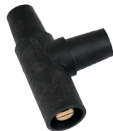
Tapping T • 400A / 600V • Male-Female-Female