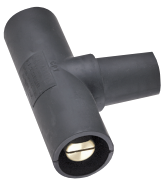
Paralleling T • 400A / 600V • Male-Male-Female