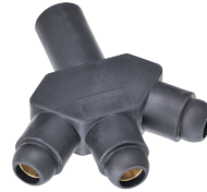
Ballnose Hard 3Fer • 400A / 600V • Male-Female-Female-Female