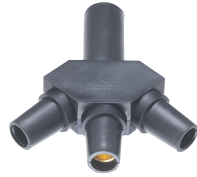
Hard 3Fer • 400A / 600V • Male-Female-Female-Female