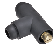
Ballnose Tapping T • 400A / 600V • Male-Female-Female