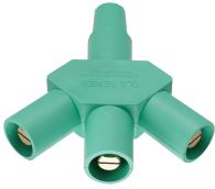
Reverse Hard 3Fer • 400A / 600V • Female-Male-Male-Male