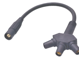
Soft 3Fer Cam • 400A / 600V • Male-Female-Female-Female