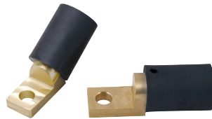
Male Angle Panel Mount • 400A / 600V

Item # CL40MR-ANGLE Item # CL40MR-OFFSET A B C D E F G H