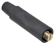
Ballnose Male and Tapernose Female • 400A / 600V • Male-Female